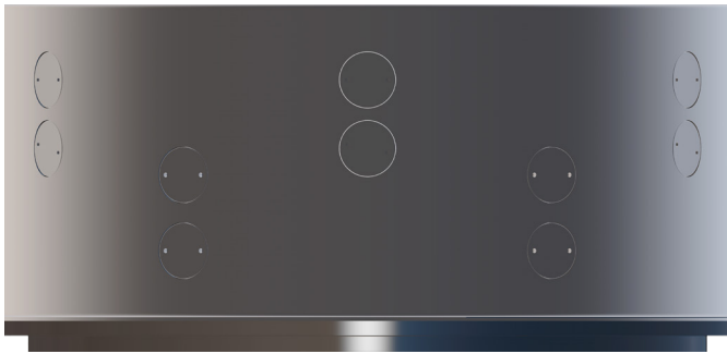
Objective APQ 150/1200 Fluorite Quadruplet Polychromat (Compensation cell)